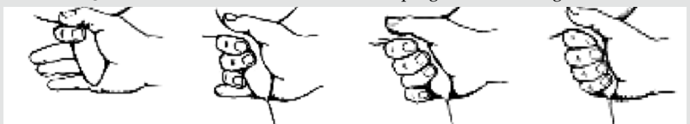
The "squeeze"-method as shown in this illustration is the best method to milk cows and goats.

When the fore-udder is nearly empty, change to the back two teats. When the milk flow ceases, you may go back to the front teats, or you may let the calf finish off and take the last few drafts. If the calf is already weaned or is not allowed to suckle, the best practice is to use an effective teat dip right after milking.