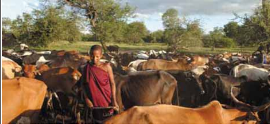
Rinderpest eradication is good news to livestock owners. Page 5