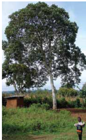
Croton macrostachyus (Mutundu)

How many trees will you plant in 2011? Let us know on 0715 916 136 (SMS). Page 4