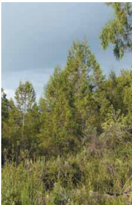
A reforested area in the Aberdares