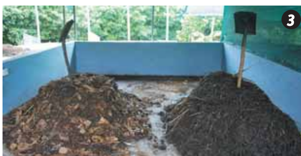
Three methods of 14-day compost: (1) Use of wiremesh, (2) use of wood, (3) use of concrete basin; it shows fresh mixed materials for compost (left) and ready compost (right). The shovel's handle is used as a stick thermometer.

into the pile and remove a handful of material from the centre. The material should be warmer and darker than the material at the outer edges of the pile. If all is well, the internal temperature should rise within the first 24 hours. If the compost is too dry, you need to add some water.