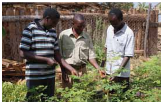
Uzima group members inspecting a Moringa nursery