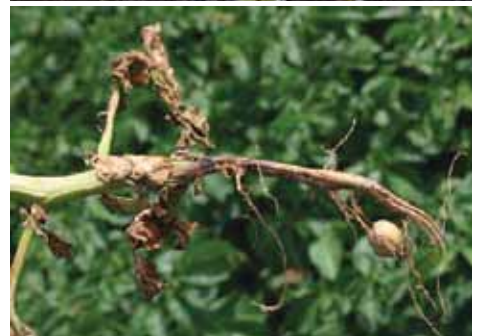
A potato plant infected by bacterial wilt (above). Diseased potato root and tuber.

Buy certified seed: Farmers should never buy potatoes meant for planting from their neighbours, if the potatoes are infected, the disease is transferred to your shamba. It is important to buy certified seed or from reputable potato growers who know more about bacterial wilt. New potato seeds should be planted in a field that has not been planted with potatoes the previous season.