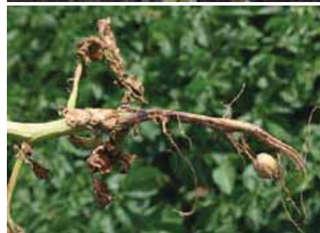
A potato plant infected by bacterial wilt (above). Diseased potato root and tuber.

Buy certified seed: Farmers should never buy potatoes meant for planting from their neighbours, if the potatoes are infected, the disease is transferred to your shamba. It is important to buy certified seed or from reputable potato growers who know more about bacterial wilt. New potato seeds should be planted in a field that has not been planted with potatoes the previous season.