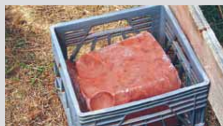
Licks last longer if placed in a holder.

in the sun for about two hours. After this, they should be removed from the moulds and left to dry indoors for 1-2 weeks depending on the weather.