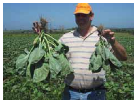
Sukumawiki grown with Trichoderma (left) and without Trichoderma application (right).

"Our crops look happier since we use biological control", he says. The company also contracts small scale farmers. He says that limitations for small-scale farmers are equipment and technical skills. "We recommend our farmers to use those products that are easy to handle. Trichoderma , for example, is easily available and a very effective biofertilizer that improves root