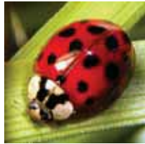
Apart from plant extracts, beneficial insects such as Lacewing (above), Ladybird (left) can control pests naturally.

develop natural immunity to infections. Preparing plant extracts: A farmer can use a number of plants to prepare plant extracts e.g. African marigold, chillies, garlic stinging nettle, black jack and pyrethrum. Chop all the plants into tiny pieces and put them into a half full 200-litre drum. Fill the drum completely with water and mix vigorously. Cover the drum completely to make it airtight. Add 4 litres of EM1 and 4 litres of molasses. Allow it to ferment for 7 to 10 days. Strain and put 200ml of the plant extracts into a 20-litre knapsack filled with water. Spray your crops at least three times a week. The extracts can protect your crop against all pests and even diseases, apart from promoting healthy growth.