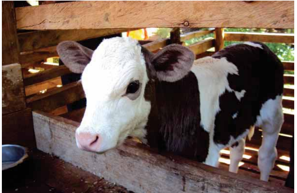
A well kept Fleckvieh-Friesian calf

Cross-breeding is the process of combining two or more different breeds of animals in order to acquire the desired characteristics of each. This is done because no one breed of cattle has all the characteristics that a farmer requires. By careful cross breeding, a farmer can add the qualities that are lacking in