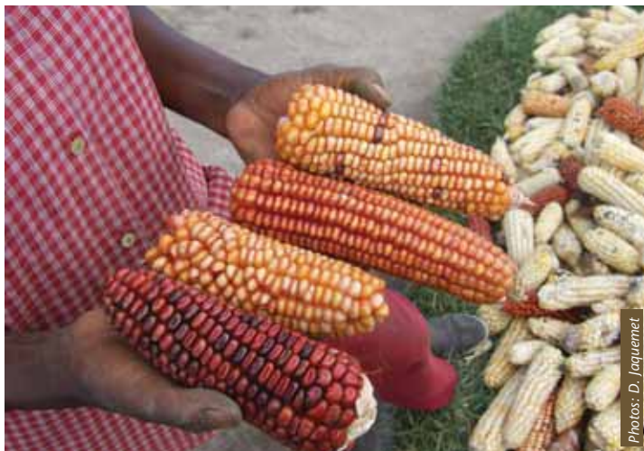
Many farmers prefer local varieties because of the better taste.