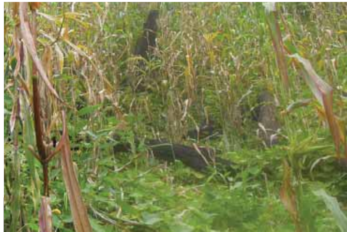
A responsible farmer checks the maize fields for signs of disease

Crop rotation: Plant the maize on a plot where there was no maize crop for two to three consecutive seasons. Thoroughly clear the farm of weeds since they can host some pests.