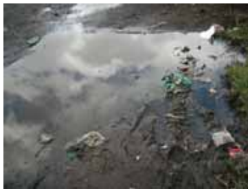
Water puddles are breeding places for mosquitoes. Mosquito nets are safe if well maintained.

The problems began when DDT was used increasingly and in huge amounts in agriculture to eliminate insect pests, accelerating the emergence of resistant mosquito populations. Because of its risks, DDT was banned in the 1970's. There are fears that DDT, intended for public health use, may be diverted to illegal agricultural application. Even if this would not be the case, the reintroduction of DDT is controversial as the so called DDT-conflict in northern Uganda between 2008 and 2011 demonstrated.