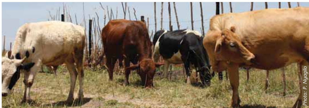
Do not expect much from your cows, if they are not given sufficient fodder, water and care.