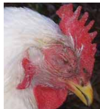
Respiratory problem symptoms: Watery eyes, swollen sinuses, sneezing and difficult breathing.

In poultry management, the farmers effort should be focused on prevention through observance of high hygienic standards and vaccination as the damage is already done when the birds are infected. Coccidiostats are very effective in controlling coccidiosis and should always be available especially in rainy weather. Regular disinfection of chicken housing is recommended to rid it of pests and parasites and other disease causing organisms.