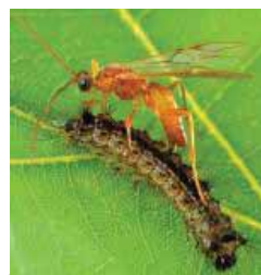
A wasp attacking a fruit fly caterpillar