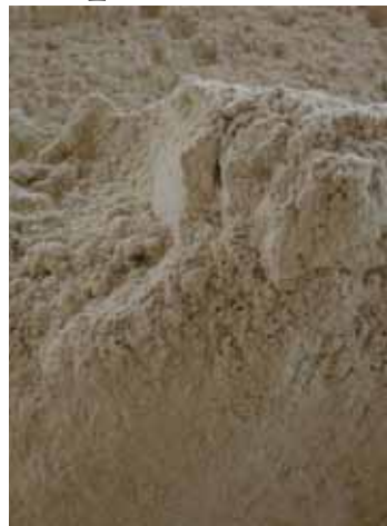
The Kensil F diatomite (left) is safe for use in cereal preservation against storage pests. Diatomite powder (right).

The month of October is the beginning of the harvesting season. But after harvest, the most common problem that farmers will face is pests. Some pests such as the Larger Grain Borer (LGB) popular known as Osama , weevils and moths destroy a large portion of stored maize. Destruction of maize by these pests can be as high as 40 per cent in most areas. The pests have become resistant to most of the pesticides in the