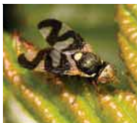
An adult gall fly