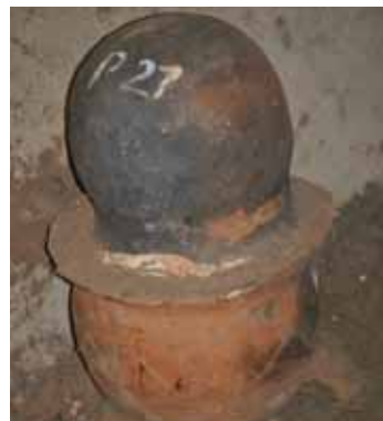
Meliponula Lendiana stingless bees domesticated in a pot hive

to produce two tonnes of stingless bee honey for the market every year," he says. A farmer can harvest different amounts of honey from each beehive depending on the bee species. For example, the average honey produced by Meliponula bocandei