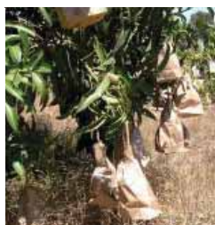
Paper bags preventing fruit fly invasion