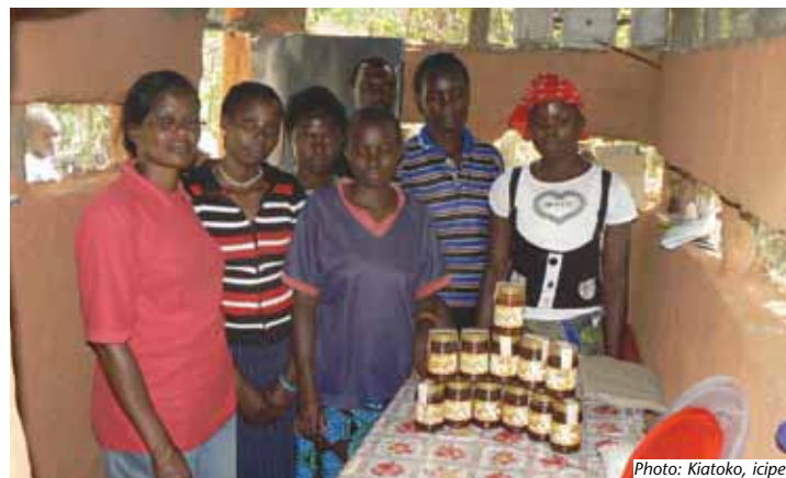
The KASBEHA members in their honey processing facility

The Organic Farmer is an independent magazine for the East African farming community. It promotes organic farming and supports discussions on all aspects of sustainable development. It is published monthly by icipe . The reports in the The Organic Farmer do not necessarily reflect the views of icipe .