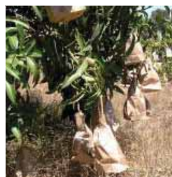
Paper bags preventing fruit fly invasion