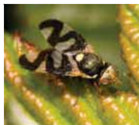
An adult gall fly