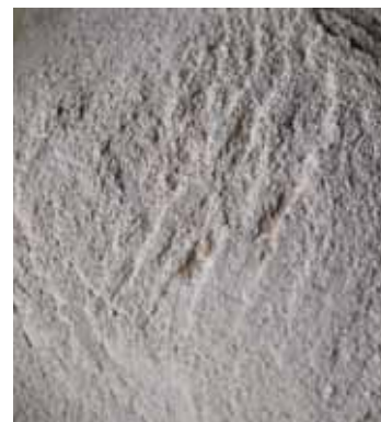
Granulated (left) is more effective in neutralising soil acidity than when powder form (right).