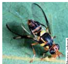
An adult fruit fly