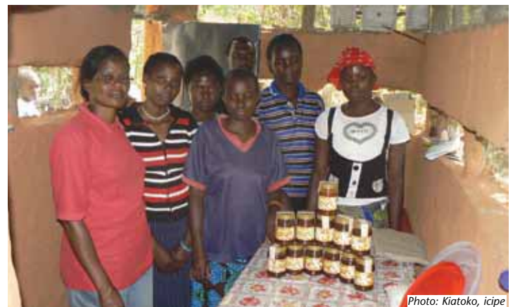
The KASBEHA members in their honey processing facility

The Organic Farmer is an independent magazine for the East African farming community. It promotes organic farming and supports discussions on all aspects of sustainable development. It is published monthly by icipe . The reports in the The Organic Farmer do not necessarily reflect the views of icipe .