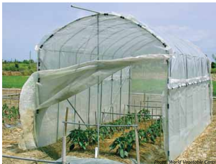
A rain shelter can be opened to regulate temperature

The beds in the shelters are raised to minimize flooding and water logging and can provide a protected environment for the production of better quality crops over the rainy season. Plastic films are used to cover the sides of the shelter if it is too