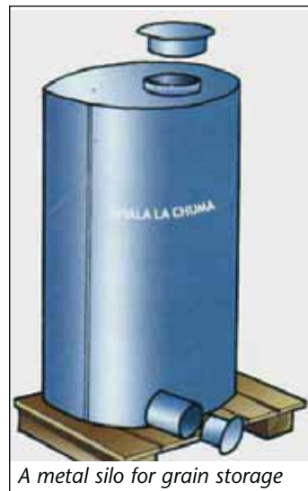
A metal silo for grain storage

Use of local plant extracts: There are many plant extracts that can be used to control insect pests in stored grains. Farmers can make use of local leaves and twigs of neem or African marigold (have insecticidal properties), which can control insect pests when