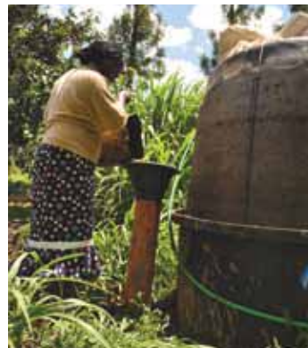
Feeding slurry into a floating drum biogas system

The system is simple to operate. The volume of gas produced