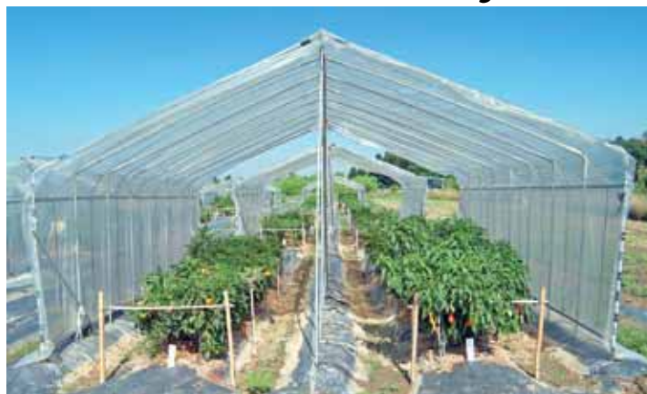
A rain shelter can be used to grow many types of vegetables and fruits

In the wet months like April and May, tomatoes become expensive in the local market because of the long rains in March to May which are followed by the cold season in July and August. However, with good timing and proper structures, a farmer can be assured of a bumper harvest and good money during this season.