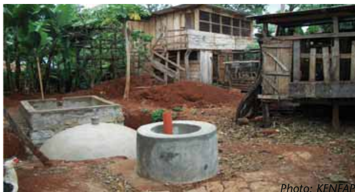
A fixed dome biogas system under construction