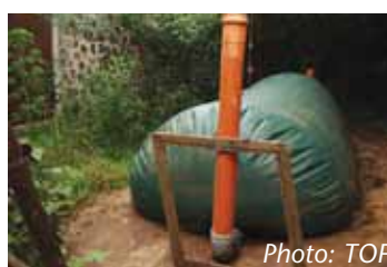
The flexi gas biogas (above) system is housed in a greenhouse to protect it from the sun and prolong its lifespan(below)

Flexigas biogas system is one of the latest Plastic Tube Digesters in the market. The system uses a plastic tube digester housed in a greenhouse to protect it from the effect of the sun's ultra violet (UV) rays that damage the plastic. The greenhouse also reduces the risk of damage from animals or people. Dominic Wanjihia, the director of Biogas International, the company that markets the system says that unlike other biogas systems, the digester is very efficient in utilisation of waste material because the greenhouse helps to maintain the temperatures at between 27°C and 34°C, which speeds up the digestion and biogas production process. "1 cow is enough to produce 1 cubic metre of biogas in a day using the system," he says. A 5 cubic metre tube system costs Ksh 40,000 inclusive of the gas burner, piping and installation while a 7 cubic metre system inclusive of all the accessories and installation costs Ksh 55,000. The system has a lifespan of 10 years. The company is already devel-