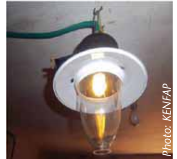
Biogas can be used for home lighting (above) and for cooking purposes (below)