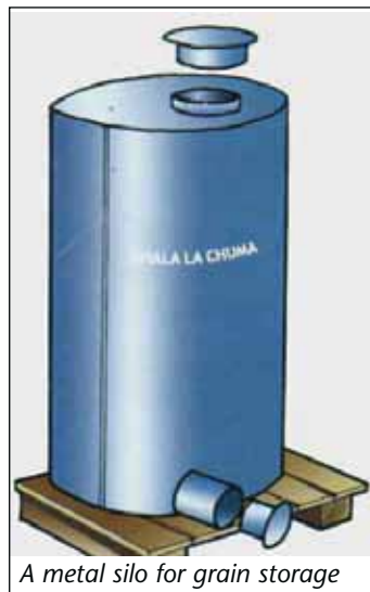
A metal silo for grain storage

Use of local plant extracts: There are many plant extracts that can be used to control insect pests in stored grains. Farmers can make use of local leaves and twigs of neem or African marigold (have insecticidal properties), which can control insect pests when