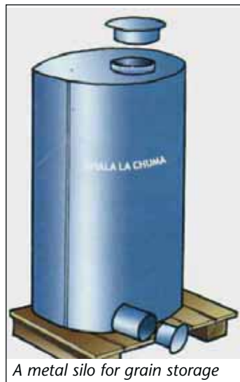
A metal silo for grain storage

Use of local plant extracts: There are many plant extracts that can be used to control insect pests in stored grains. Farmers can make use of local leaves and twigs of neem or African marigold (have insecticidal properties), which can control insect pests when