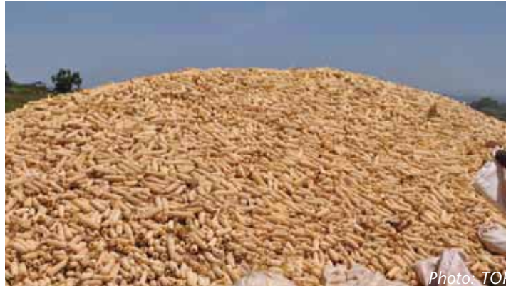
Most farmers incur huge losses due to lack of proper maize storage

Maintain hygiene: To prevent damage to stored products, keep the stores and the surrounding areas clean. Before storing the grain, check for leaks, splits, cracks and repair them. Also ensure that the floor and the walls are easy to clean as insects hide in small holes found in walls. Do not mix the previous harvest with the new harvest.