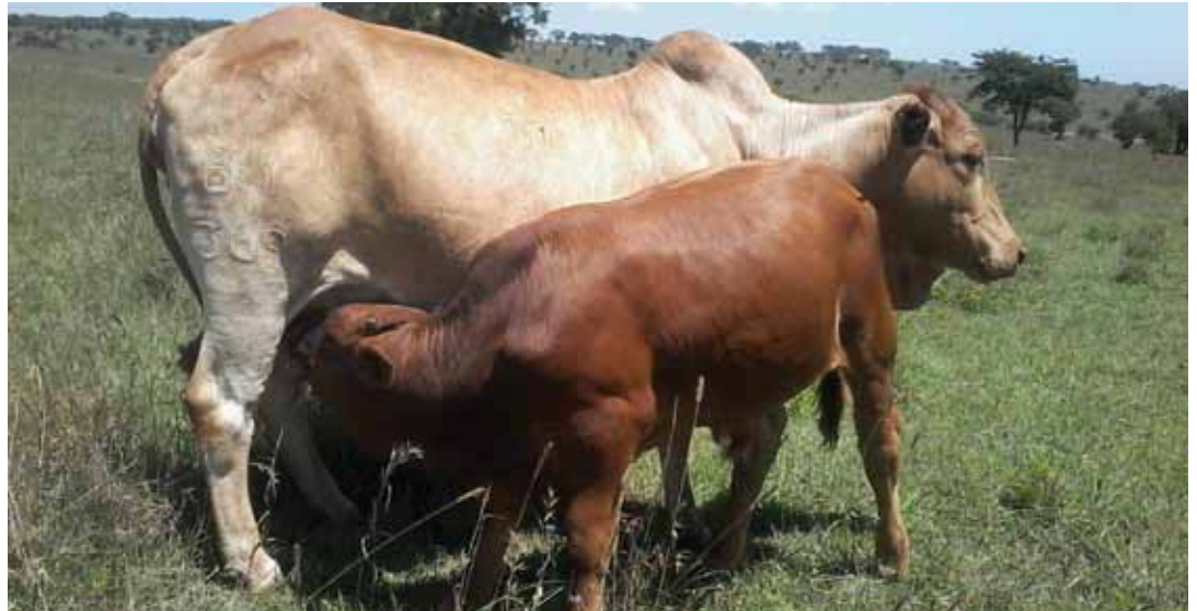
A four month old Fleckvieh/Boran cross suckling at Olooltepes ranch.

Josphat Chengole | Reliable feed and water are the major challenges in beef farming. Fodder is usually plentiful during the wet seasons and limited during the dry season. At the same time, the natural pastures that support most of the livestock production in the Arid and Semi-Arid Lands (ASALs) are being degraded due to poor management systems. During the wet season feed is plentiful and often exceeds the demand, resulting in waste. In the dry season and drought spells, the demand for fodder exceeds the supply. To keep their animals in good shape throughout the year, beef farmers must conserve fodder by making hay and