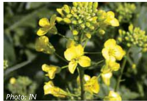
A Canola oil plant