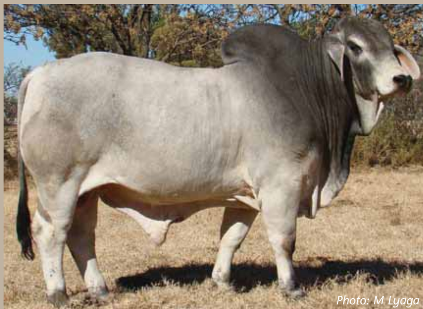
A Boran bull (left)

Weight: At birth Boran calves weigh about 28kg for males and 25kg for females. Mature cows are medium sized averaging a live weight of 350 - 400kg, with great mothering skills. Mature