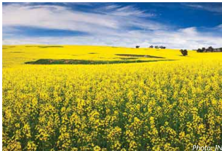
Canola crop under large scale production in Western Australia

could be a source of income," he says. He had gone to purchase a goat from a farmer at Naromoru, who explained the value of the plant.