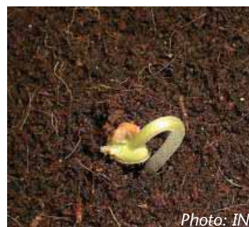
A bean plant sprouts in coconut coir medium.

The requirements for composting are the presence of soil microorganisms and organic material such as animal manure (farm yard manure) crop