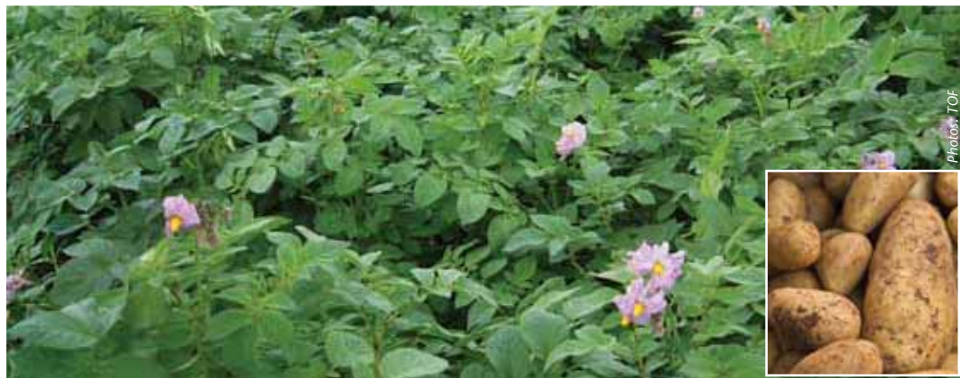
Importation of potato seed without inspection is likely to compromise seed quality in the country.

The government has allowed the importation of new potato seed varieties from Netherlands without subjecting them to the mandatory inspection procedures by the Kenya Plant Health Inspection Service (KEPHIS),