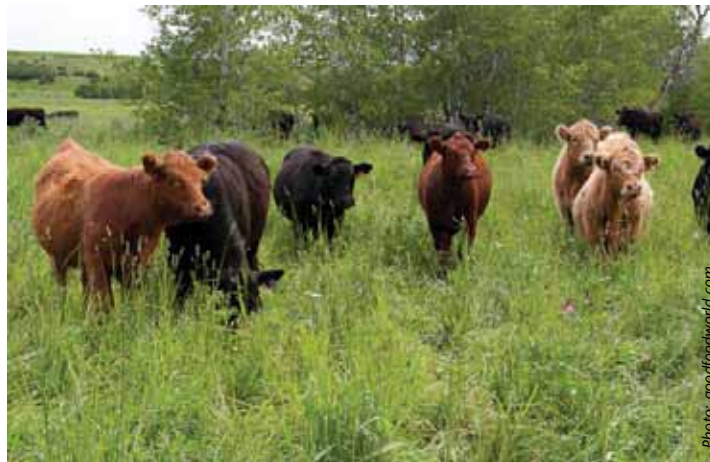
Buffel/African foxtail grass is highly regarded by cattle producers in the semi arid lands of Baringo County.

Remove cows from the herd that have been identified as poor