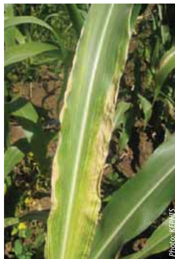
An affected maize leaf

With this year's planting season just approaching, some farmers whose maize was affected by Maize Lethal Necrosis (MLN) disease last year want to know if