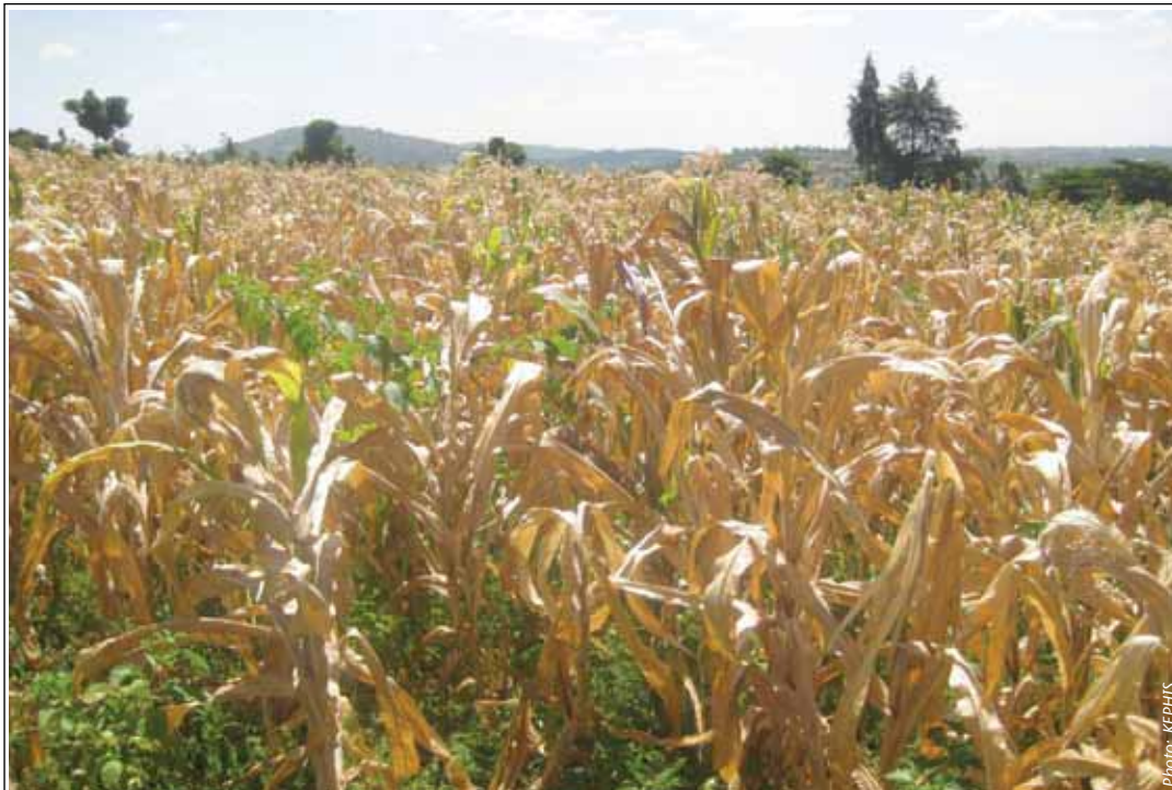
A maize field affected by the MLN disease (above). Any maize planted in a farm that was affected by the MLN disease last year will be affected again. Farmers should plant a different crop to break the disease cycle.