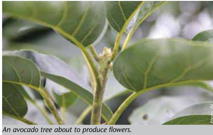
An avocado tree about to produce flowers.

Studies have shown that the growth of an avocado tree and its fertilization through pollination occur at the same time; both processes compete for nutrients stored in the tree. The competition for nutrients has been thought to be one of the reasons that the tree loses its flowers and fruits.