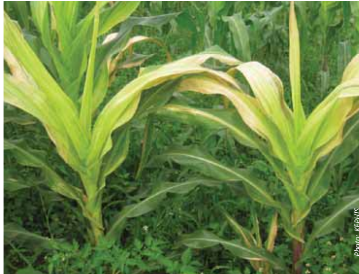
The disease first shows in the upper leaves of the maize plant.

The disease is spread by crop pests such as thrips, which remain in the soil after the maize is harvested. Immediately the maize is planted, the pests still in the soil will attack and infect