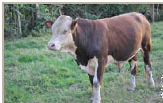
A Hereford bull at Suam orchards ADC farm in Trans-Nzoia county.

Essentially, the nutrient needs of a dry cow are lower than that of a lactating cow. A dry cow needs 50% to 65% of the feed of a cow nursing a calf. Young calves have an efficient feed conversion rate for dry feed. It is better therefore to wean calves early as a way of using the limited feed better especially during the drought. This must, however, be