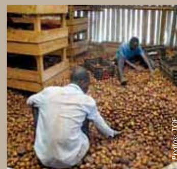
Workers sort out potato seeds at KARI, Tigon.

A survey conducted by KARI in most of the potato growing areas in the country shows that farmers prefer the traditional potato varieties to certified seed due to their availability and marketability. In a report that is yet to be officially released, scientists say apart from the Sangi variety, farmers in every region prefer their own local potato varieties. For example, farmers in Elgeyo Marakwet region prefer two local varieties, Sangi and another one called Discus . In Central region farmers have three common varieties - Sangi , Thima Thuti , Mugaruro , Kalusi and Ndera Mwana , in Mau Narok, farmers prefer Tigon long.