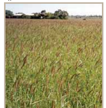
Buffel/African foxtail grass ( Cenchrus ciliaris )

Notice: Interested farmers can get Cenchrus seed from KARI-Marigat at KES 600 per kilogramme. Talk to the Marigat sub-county Livestock Production Officer 0724 84 88 16.