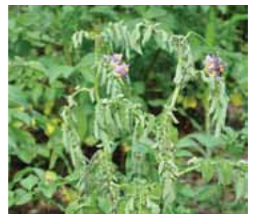
Wilting of potato leaves is a clear sign of bacterial wilt (above).

• If available, farmers should buy seeds at certified seed growers or seed multiplication