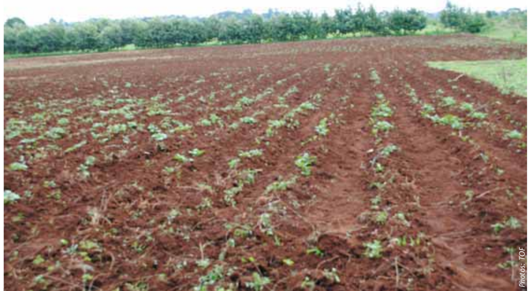
Many farms in Kenya cannot produce potatoes due to the spread of bacterial wilt.

Bacterial wilt can spread through infected crop residues, contaminated surface run-off water or even water used for irrigation. Farmers can also spread the disease through farming tools such as jembes or forks when contaminated soil attaches itself to the tools. Insects or soil-borne pests such as nematodes can also spread bacterial wilt to potato