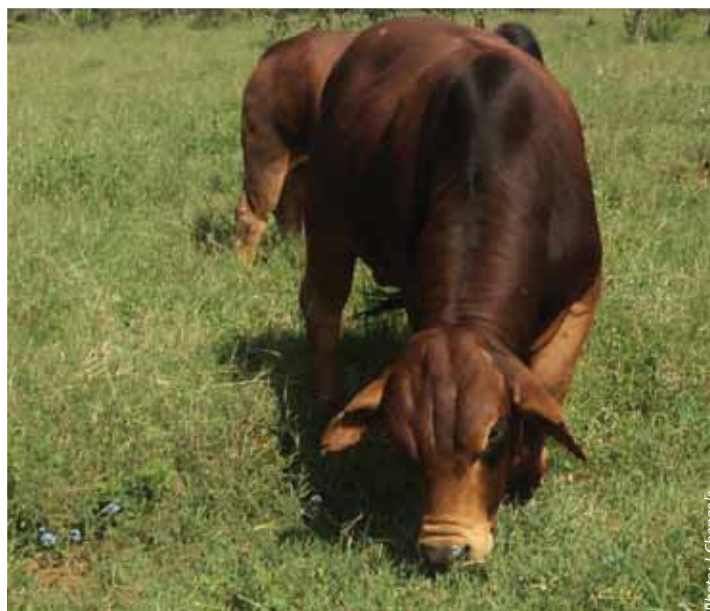
A mature Sahiwal bull at the Kerio Valley Development Authority (KVDA) farm in Marigat.

Talk to the centre directors of the two stations on 0770 735 453 and 0773 479 017 respectively for more information. Farmers can get Sahiwal Semen from Kenya Animal Genetic Resources Centre (formerly CAIS). Talk to an Artificial Insemination (AI) agent or semen distributor in your area.