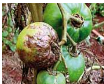
Late blight in tomatoes fruit (above) in tomato leaves (below).

• Milk: Spray every 10 days with a mixture of 1 litre of milk to 10 or 15 litres water.