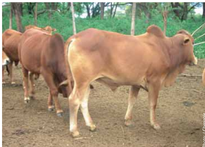
A one year old Sahiwal bull at KARI- Perkerra station, Baringo.

According to research conducted by KARI, the breed is a good milk producer - compared to other local breeds and is capable of an average of producing about 8-10kgs per day, with a fat content of 4.5 %, within an average lactation period of 10 months. Sahiwal has larger teats compared to other Zebu breeds, making milking easier. They produce small calves (average weight of 27kg) without diffi-