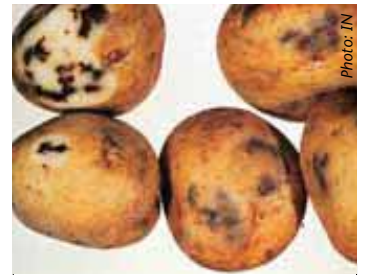
Early blight in potato tuber (above) on potato leaves (below).