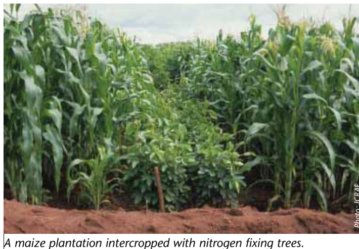
A maize plantation intercropped with nitrogen fixing trees.

Farmers also benefit from more money from fodder, fuel wood, food and building materials. In very humid areas, the land has at least 20% tree cover while the driest agricultural areas have less than 5% tree cover. Farmers should therefore plant the right trees, which not only provides food for beneficial insects like bees but also prevent erosion of valuable top soil, act as wind breakers and keep away pests.