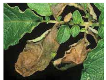
Early blight in potato leaves (above) on potato tuber (below).