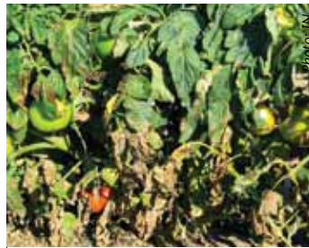
Early blight in tomatoes leaves (above) in tomato fruit (below).

Control: Use wider spacing. For tomatoes you can also prop up the plants to keep them off the soil. Add mulch to cover the soil and reduce splashes of water. Pruning will increase air movement, reduce humidity within the crop and thus reduce disease intensity. If you irrigate, do it in the heat of the day; this