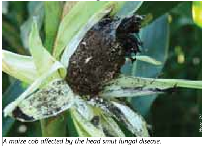
A maize cob affected by the head smut fungal disease.

The affected maize cob develops white swollen pouches, which turn black, and then burst releasing more black spores that later infect other maize plants. The affected maize becomes