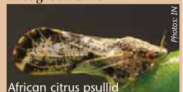
African citrus psyllid

When the African citrus psyllid feeds on an infected tree, it can pick the bacteria that causes the greening disease. The tiny insects then carry the bacteria throughout its life.