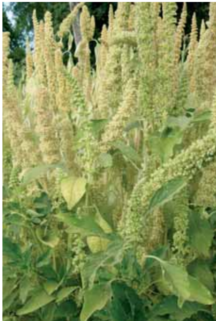
Amaranth improves nutrition (TOF)

Planting can be done direct from the seeds. However, because Amaranth has a deep and wide hairy root structure, it will battle for nutrients if grown with very close spacing. My