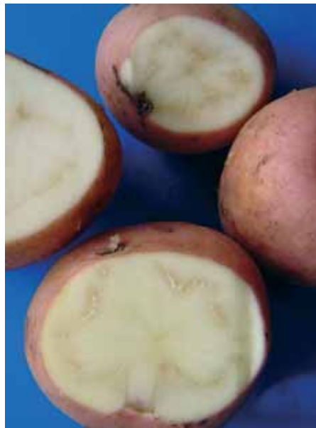
Potatoe farmers incur huge losses due to bacterial wilt

How do the chemicals get out of the plants and into the soil? The answer is short: The chemicals are released when the cell walls of the fresh plant are broken down. Chopping plants very finely is the best possible option. But there still remain large pieces of unbroken leaves in the field. Phillipine farmers use a rotary hoe or rotavator to chop leaves and mix them into the soil. With this method, they reduce bacterial wilt by 50-70%. In Kenya,