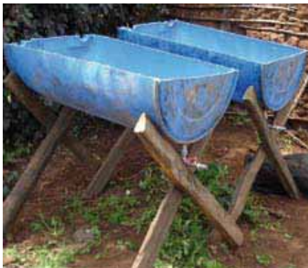
One drum makes two units. The photo shows a tap in the front as a drainage and collection hole. This is not necessary and can be replaced with a hole at the base of the drum.

Now the worm housing is almost ready. If we were to introduce the worms at this stage, however, they would die, as it is too dry. We must therefore pour water over the interior contents until we have ensured adequate moisture throughout the entire materials. This is also a good test to see if your drainage works properly. On adding water, you should see the excess run out of the drainage hole at the bottom of the tank. If this does not happen, something is wrong