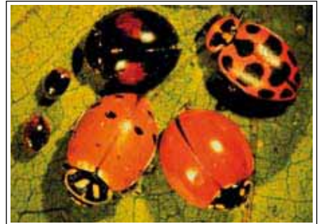
Aphid predator: Ladybird beetles

Resistant varieties: It is also good to use crop varieties with natural resistance to particular pests and diseases. The problems can be significantly reduced. Source: Soil Association, UK ■