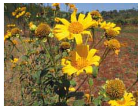
Tithonia diversifolia shrub

Another useful shrub is Tithonia diversifolia , which is common in roadsides