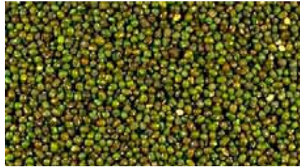
Green gram seeds

Once rolled, the paper towel should be placed inside a plastic bag to keep it from drying out. Finally, place the plastic bag in a warm spot. Before rolling the sheets, make sure the seeds are not too close to each other. Seeds