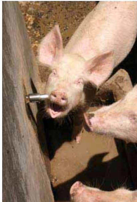
Piglets drink water from a nozzle (TOF)

Most farmers do not build the right structures that can offer protection to pigs. Unless provided with adequate space for movement and rest, newly born piglets have little chance of survival, as they get smothered by the sow (mother pig). The construction of the pig shelter has to take into consideration the climatic conditions in an area. For example in cold areas, piglets die from pneumonia. In such areas, it is important that farmers put up structures that help retain heat and protect them from the cold, apart from taking other measures that protect the young from adverse weather conditions. Pig structures can be built using local materials, but farmers have to maintain a high standard of cleanliness. Lack of cleanliness and general neglect by farmers