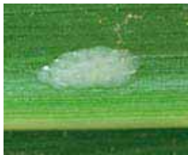
Stalkborer eggs on a maize leaf

Monitor plant growth throughout the growing season to observe crop conditions and to recognize any attack by maize stalkborers. To monitor, start looking for stalkborer egg masses when the plant is a month old. The egg masses are found on