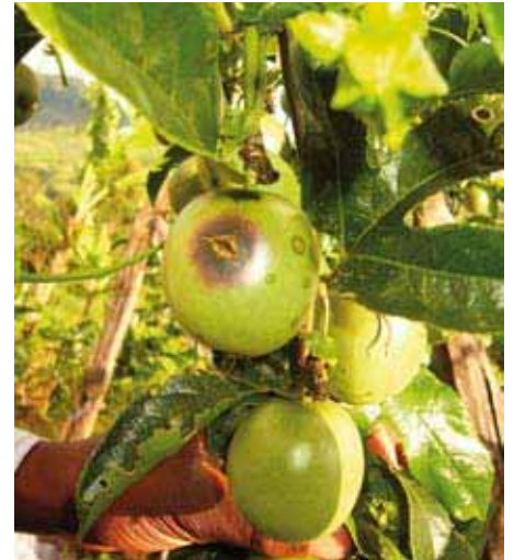
Pest-infested passion fruit

Passion fruit has a deep root system, therefore proper land cultivation is necessary. Deep ploughing and harrowing is needed due to hard pans in the soil. Planting holes of 45 x 45 cm at the spacing of 2 x 3 m for hand cultivation and 3 x 3 m for mechanized cultivation is recommended at least