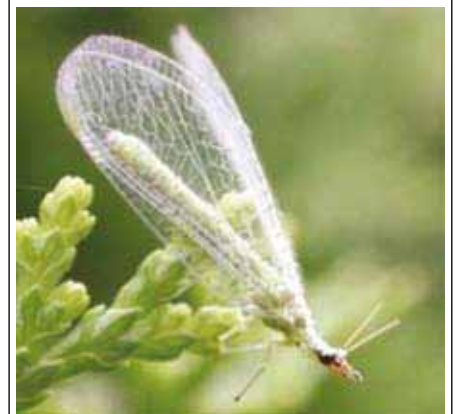
Aphid predator: Lacewing