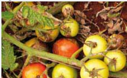
Tomato varieties not supported by sticks are prone to blight.

contaminated soil does not come into contact with the leaves or the stem, thus reducing the chances of spreading the diseases.