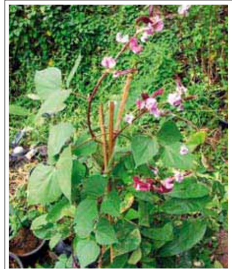
Legumes: nitrogen factories

All plants need nitrogen to grow well. In theory, there is no lack of nitrogen. Air consists mainly of nitrogen (78 percent), but most plants are not able to take nitrogen directly from the air; they need it in modified form. Some plants, especially from the legume family, are capable of fixing nitrogen directly from the air with their roots, and changing it into a soluble form as nutrients. Some of this nitrogen is spread in the soil and can be used by neighbouring plants. That is why intercropping is important (see page 2). The effect is even better when legumes are dug into the soil. They enrich the soil with nitrogen, and plants growing next on the same field benefit from this readily available nitrogen.