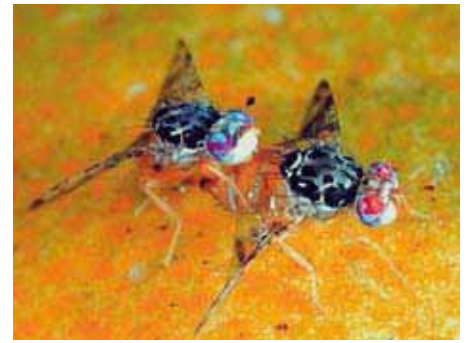
Fruit flies: Ceratitis capitata mating

Baiting technique: The traditional method of fruit fly control is based on use of food baits. The bait attracts the fruit flies from a distance to the spot of application, where the flies feed on the bait, ingest the pesticide and die. The bait is normally applied to a 1 square meter (1 m 2 ) spot on the canopy of each tree in the orchard on a weekly basis, starting from when the fruits are about 1 cm in size and continues till the very end of the harvest. Several commercial baits are available in the market, such as NuLure, Buminal and Solbait, that can be mixed with pesticide such as Spinosad and applied as above. Another commercial product is GF-120 (Success). This bait is already pre-mixed with pesticide (Spinosad)