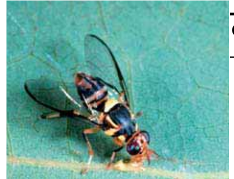
Bactrocera invadens male enlarged 800 times and can be applied using the on-label information on the container.

Major problems in the use of baits in Africa is that they are expensive and inaccessible to a large number of fruit growers. Research at ICIFE has shown that a protein bait from brewer's yeast obtained as an industrial by-product provides good control of mango infesting fruit flies when applied in low volumes as spot spray to 1 m 2 of mango canopy or to the mango trunk. Research is continuing to formulate the bait to enhance its attractiveness to fruit flies. The new bait should be available as an alternative to imported products in the very near future.