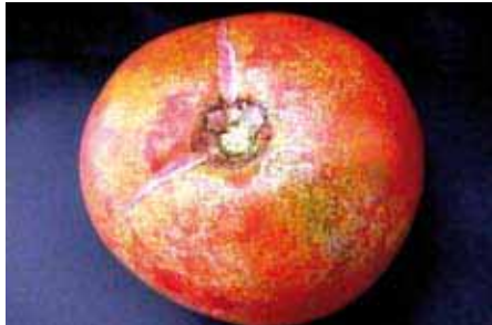
Tomato plant and fruit infested by spider mite

ticides (botanical or synthetic) only when it is really necessary. If you want to use neem, look for a product that contains a high proportion of neem oil, as it is more effective.