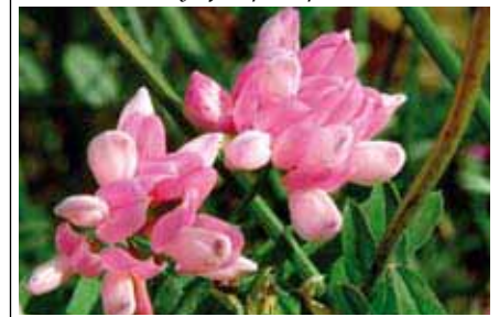
Legumes: Lablab (above), mucuna (below).

with the main crops they compete for nutrients, water and light, but the benefit of having a source of high protein food (e.g. beans) may outweigh this.