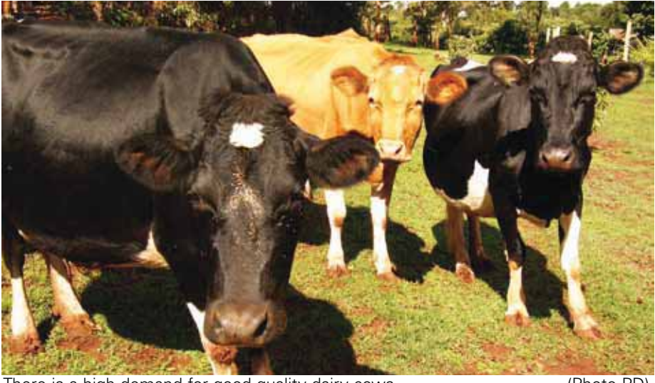
There is a high demand for good quality dairy cows.