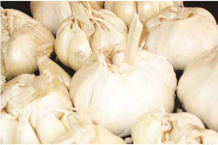
Well cured garlic bulbs ready for market

Garlic can grow well at an altitude of between 500-2000 metres above sea level. The right temperatures for garlic are between 12-24 °C. Extremely high temperatures are not suitable for garlic production. Excess humidity and rainfall interferes with proper garlic development, including bulb formation. The crop is grown in low rainfall areas where irrigation can be practised, especially in early stages when the plant requires enough water to growth. Adequate sunlight is important for bulb development. Garlic develops its flavour depending on sunlight conditions during growth.