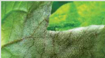
Characteristics of Botrytis are the grey spores

sider your management. Plants that are weak, e.g. from lack of nutrients, lack of water, over-watering, or insect-infested plants are attacked more easily by fungi and other diseases. Ensure good drainage of the soil, give the plants enough space and air, and be careful with watering. Remove damaged plant material as soon as you notice it. You may protect your plants by applying fungicides whenever the weather is very wet. Copper fungicides, neem oil, or potassium bicarbonate may be helpful.