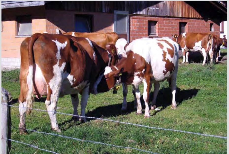
A herd of Simmental-Fleckvieh crossbred dairy cows in a Swiss farm.

Fleckvieh character: The breed is a dual-purpose cow that can be used for both dairy and beef production. Compared with the Holstein-Friesian, Fleckvieh produces less milk and is consistent in production; but it requires less feed to produce the same amount of milk as a Holstein-Friesian. Therefore it is an efficient cow. According to many comparison studies, done in Switzerland, Germany and also in South Africa, Fleckvieh gains faster weight than other breeds. It is less susceptible to diseases such as mastitis and even ECF. It has proved its qualities in the European lowlands as well in the mountains. These qualities