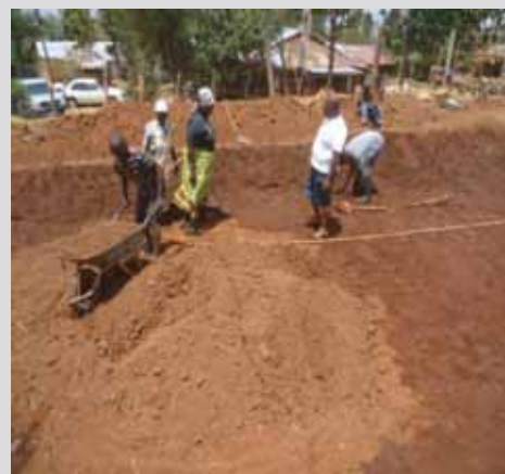
Mixing soil with lime (left). Preparing mud for plastering (right).