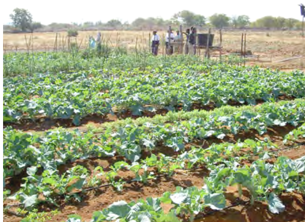
Picture: A lush vegetable field.

Fertigation is the application of liquid fertilizer through the drip lines. You may use filtered plant and manure teas. Take care to flush the system afterwards, because nutrients and organic substances that remain in the tubes and emitters promote growth of algae and bacteria, and formation of slime and biofilms that can clog the system.