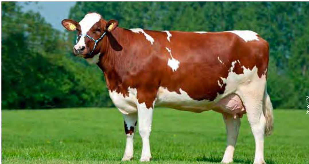
A Fleckvieh dairy cow: The Fleckvieh is a hardy breed with a large body frame

For instance, you can ask him/her to show you the bull catalogue from which you can select