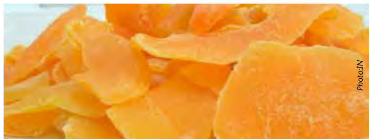
Dried mango chips: Drying mangoes can reduce wastage

Mangoes contain good levels of bone-building vitamin K; vitamin K is also important for proper calcium absorption, another important function of bone health. Mangoes also provide calcium, which is a major bone nutrient.