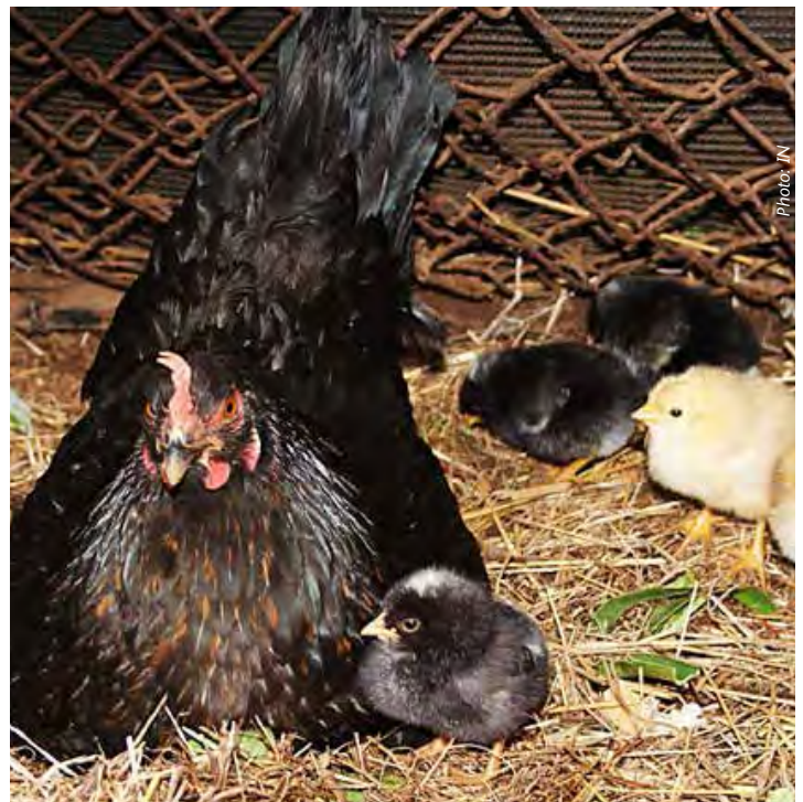
A hen with her chicks