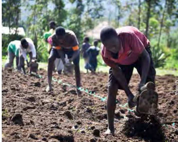
Using certified seed increases maize yields and income

Another problem that faces farmers is buying their maize seed or planting late due to lack of proper preparations. Ideally, all maize should be planted by mid-March. But due to the impacts of the changing climate sometimes, maize planted in March may fail if the rains are insufficient. So, it is advisable for farmers to subdivide their land into two portions with one portion planted in March while the other portion is planted in mid-April. This will help prevent loss of inputs such as seed and even labour if the rains fail.