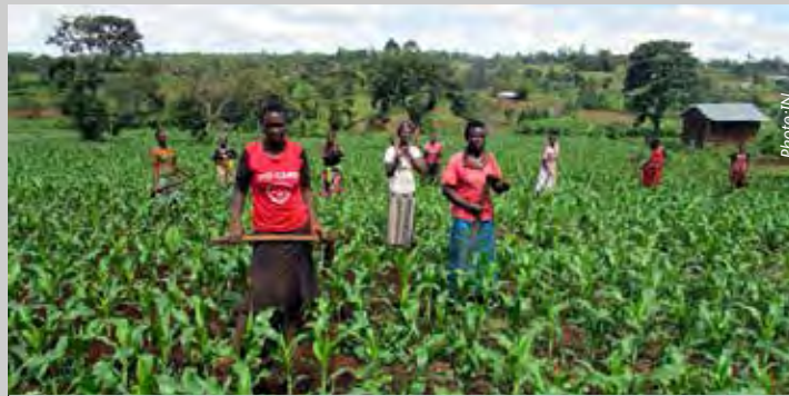
Farmers working in a maize field

Western Kenya: Kakamega, Bungoma, Busia, Kisii, Nyanza region: Homa Bay, Suba, Migori, Rongo, Siaya, Bondo, South Rift: Tinderet, Nandi, Kericho, Bomet, Narok, Sotik, Trans-Mara, Central Province: Muranga, Kiambu, Kirinyaga, Eastern Province: Machakos, Kitui Mwingi.