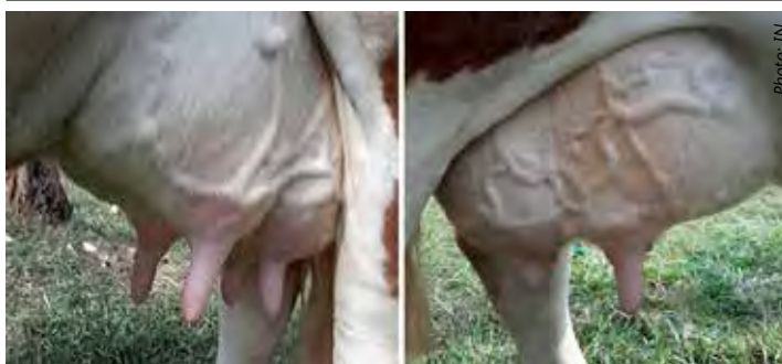
Udder size and placement is important in dairy cows

another Fleckvieh bull with superior genetics (Ensure you check the semen straw you kept when serving the mother of this heifer that semen from the same bull—her father is not used to serve her because this will amount to inbreeding).