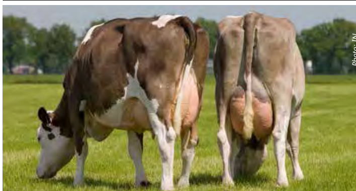
Cross-bred Fleckvieh-Friesian dairy cows