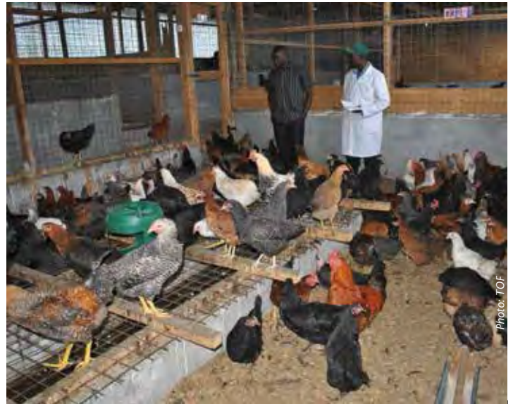
Proper housing is important for any successful chicken rearing

A brooding cycle takes a minimum of 18 days after which the first eggs start hatching, averaging to 21 days to hatch. A higher hatchability rate of between 80-100% can be realized from indigenous chickens provided they are kept well; a percentage higher than artificial incubator where small number of eggs are to be hatched.