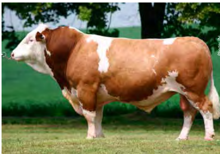
AI Semen is obtained from high quality bulls