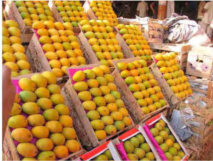
Mangoes in a market stall

Due to the perishable and bulk nature of mangoes and lack of market information and organized marketing farmers' groups have a weak bargaining position. However, in Mutulani village in Makueni County, things are different. Members of Pamoja Mango Farmers Group are reaping the benefits of collective selling.