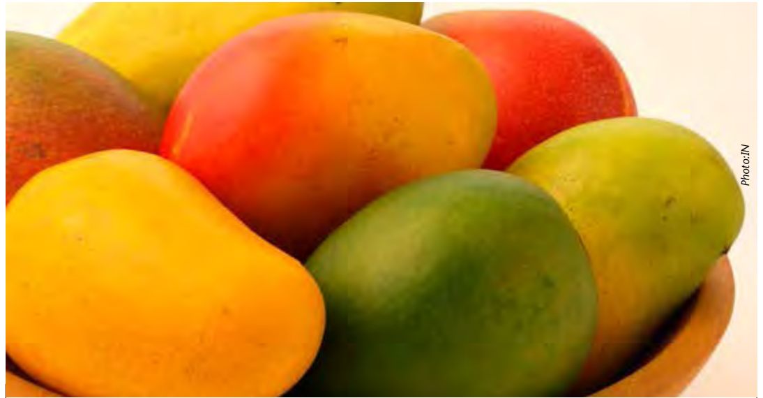
Mangoes have many vitamins that maintain health and vitality