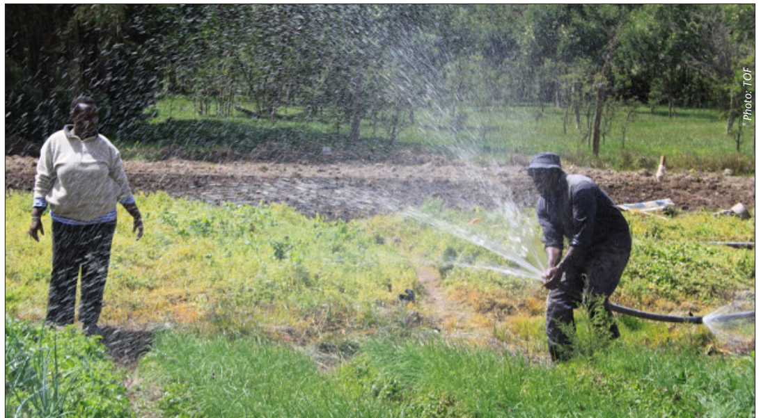
Farmers irrigate their land in Miti-iri, South Kinangop. Farmers should choose the right irrigation technologies such as drip irrigation that use water more efficiently and help to reduce wastage

Increasing water productivity is an important element in improved water management for sustainable agriculture, food security and a healthy ecosystem.