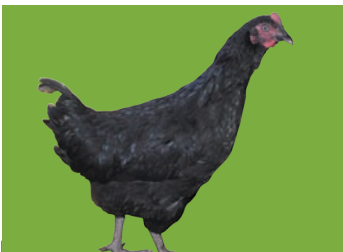
A KARI improved hen

"The majority of Kenyans prefer eating Kienyeji chickens. This provides to ready market this