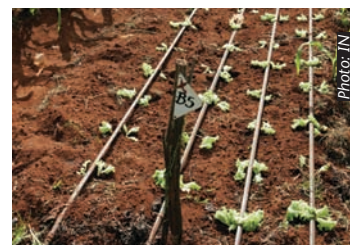
A drip irrigation system

However, farmers need to consider the returns they get when they use irrigation, as