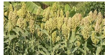
Gaddam sorghum in a field

For more information on sorghum growing, go to http://www.infonet-biovision.org/PlantHealth/Crops/Sorghum