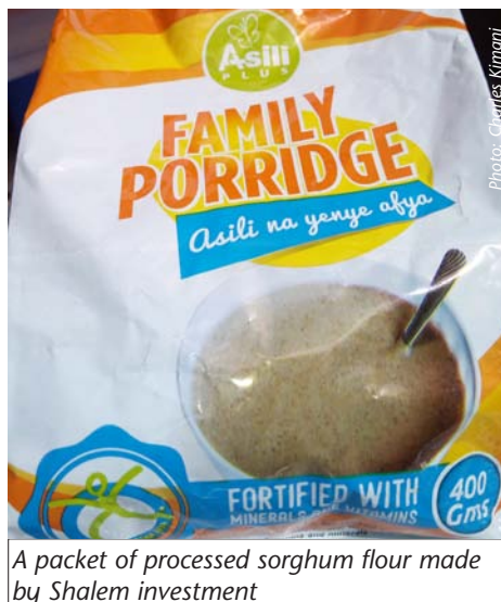
A packet of processed sorghum flour made by Shalem investment

The company works with over 20,000 small-scale farmers, and offers competitive prices to