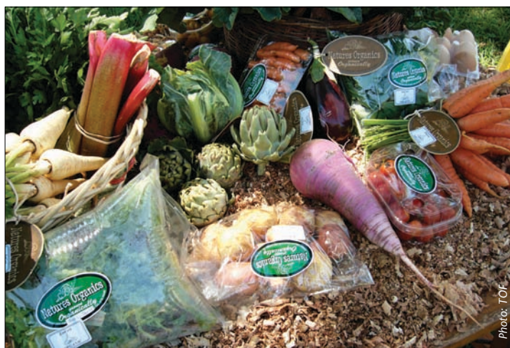
Labelled organic produce on display in the market

It is now clearer that conventional agriculture or industrial agriculture with its focus on monoculture (growing only one type of crop) is no longer sustainable. It has been found that to produce enough with heavy use of chemical fertilizers and pesticides that destroy the environment is simply neither sustainable nor healthy. Organic agriculture is advocated because of its effect on protection of biodiversity. Biodiversity is the combination of the various forms of life on earth. Moreover, health, food and nutritional security are inadvertently linked. Increasingly, Non-Communicable Diseases (NCDs) are the leading causes of death in most regions except Africa and it is predicted that by 2020 the largest increases in NCD deaths will actually occur in Africa. By 2030, in Africa, deaths from NCDs are projected to exceed the combined deaths of communicable, nutritional diseases, maternal and perinatal deaths.