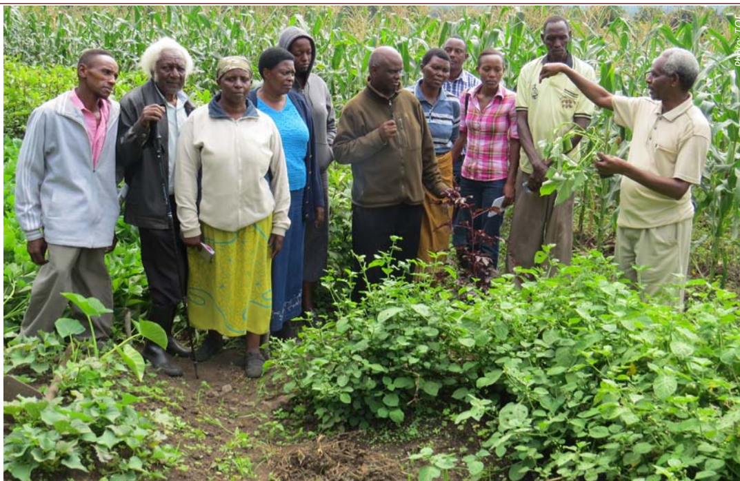
Farmers receive training on Ecological Organic farming in Arumeru Arusha, Tanzania

Indeed, BvAT is a product of institutional strengthening that initially got support from Swedish Society for Nature Conservation (SSNC) with support