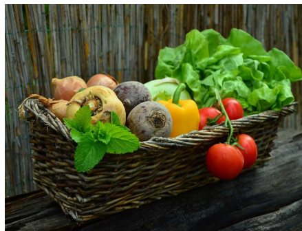
Figure 1: Aldridge, S. M. (n.d.). Eating the Rainbow. Retrieved from https://hemaware.org/mind-body/eating-rainbow