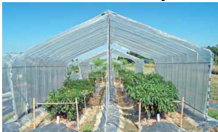
A rain shelter can be used to grow many types of vegetables and fruits

In the wet months like April and May, tomatoes become expensive in the local market because of the long rains in March to May which are followed by the cold season in July and August. However, with good timing and proper structures, a farmer can be assured of a bumper harvest and good money during this season.