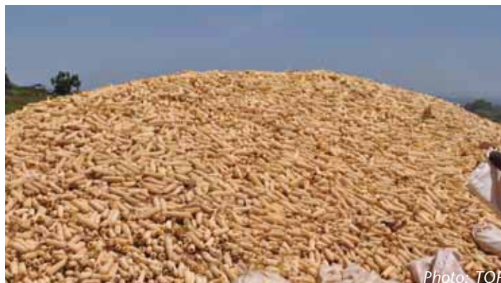
Most farmers incur huge losses due to lack of proper maize storage

Maintain hygiene: To prevent damage to stored products, keep the stores and the surrounding areas clean. Before storing the grain, check for leaks, splits, cracks and repair them. Also ensure that the floor and the walls are easy to clean as insects hide in small holes found in walls. Do not mix the previous harvest with the new harvest.