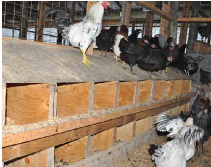
Vaccination against the following diseases is recommended

tion is always the first line of defence against diseases. Ensure that all your chickens are vaccinated against the most common diseases such as fowl pox, Newcastle, Mareks and coccidiosis diseases. Diseases make chickens weak and retard their growth, feed conversion, egg production and eventually reduce the good returns that farmers desire. The poultry farmer should always observe their birds carefully, several times a day for signs of sickness in their flock. Sick birds usually stand half asleep at the corner of the house, with ruffled feathers, heads hidden into their wings and with drooping tails. Isolate any sick bird to prevent the spread of the disease to other birds. Consult a vet as soon as possible to treat the birds on time and avoid loss.