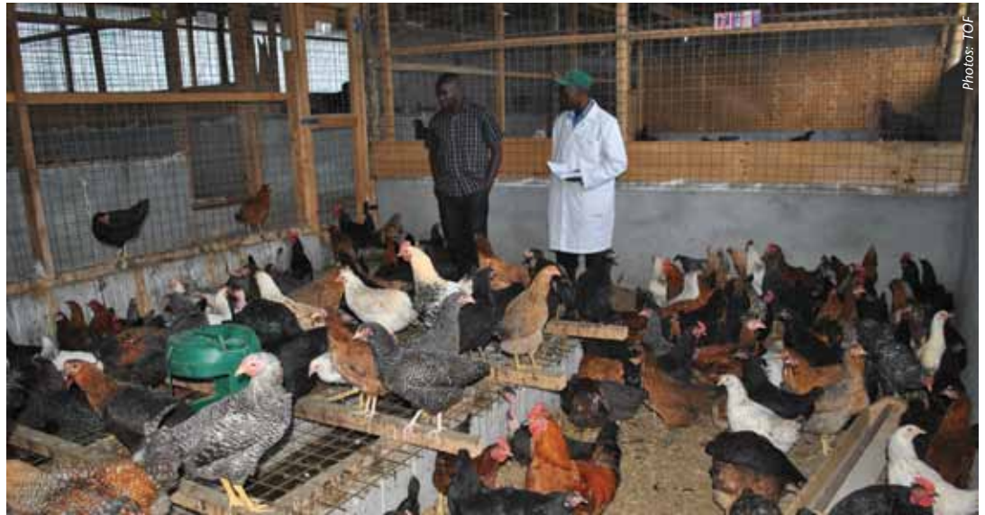
Good housing is important in poultry management for both hybrid or indigenous chickens.

Housing: Housing is a challenge to many farmers who rear chickens. Poor housing exposes chickens to various risks. A good chicken house should protect the chickens from the cold and wind. It should keep away predators such the mongoose, dogs, wild cats or snakes. The house should be spacious enough to reduce congestion, which causes stress in chickens and even cannibalism and pecking. Ideally, each chicken requires at least 2 square feet of space.