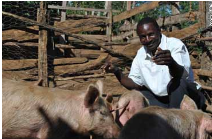
If well fed pigs attain desired weight quickly. Farmers can prepare their own feeds to reduce cost of production.

Assuming a farmer has 10 piglets to feed, they can isolate a creep area (housing for young ones) where their mother cannot