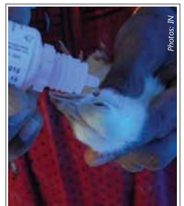
Intra-ocular (eye drops) vaccination.

Any new birds should be isolated from the rest and observed for any signs of disease before they are mixed with other birds. Spray or dust your birds with acaricides to prevent pests and parasites at all times to ensure the birds are healthy and productive.