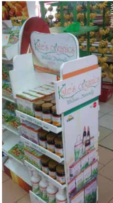
Proper packaging can make your product sell well.

Once you select the crop, you need to go the next step in allocating the land from which you will establish each of the crops. You also need to estimate the production period for each crop, and