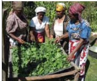
Preparation for drying