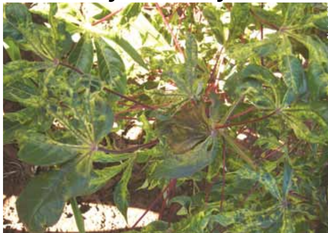
Careful selection of planting material can help reduce incidences of Cassava Mosaic Disease.

Almost all cassava diseases are spread by planting infected stem cuttings. The viruses, bacteria and fungi, which cause various diseases survive on or inside cassava stems and are easily carried to new fields in this way.