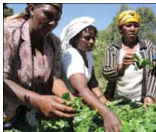
Draining excess water