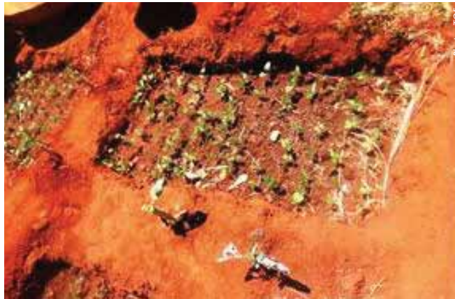
Zai pits help conserve water that is utilised by plants to grow.

Katoloni centre since early 2013. From what he has learnt, he can now make zai pits, watersheds and furrows to harvest rainwater, which he has used to grow various crops. He now applies charcoal remains (Biochar), farmyard manure and green manure from his farm to improve soil fertility and improve soil water retention.