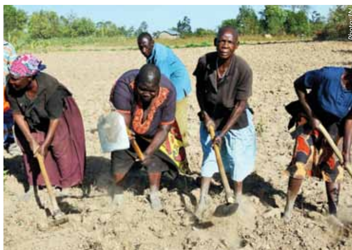
Group members work together in their demonstration plot.

Through demonstrations, SINGI extension workers have shown farmers how to test and confirm the usefulness of improved cultural methods like