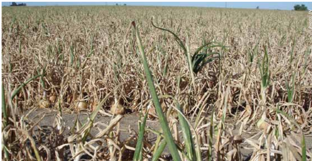
An onion plantation affected by IYSV disease: The disease can damage up to 75 per cent of an onion crop. It has no cure.

Symptoms of Iris yellow spot virus on onion include yellow to straw coloured lesions (wounds) on onion leaves and stalks. Dry, elongated lesions or flecks may resemble thrips injury. Lesions may be diamond shaped (this occurs rarely on leaves, more commonly on scapes). Late in the season, infected seed stalks and leaves may fall. Plant vigour and bulb size are also reduced including the onion yield.