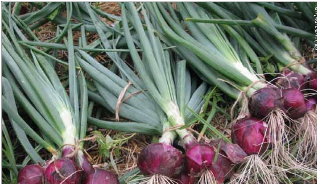
Farmers in Kenya lose up to 75 per cent of their onion crop due to pests and diseases. Many however, do not know that the onion varieties they choose may be responsible for their losses. Some onion varieties are more prone to diseases because of their colour and shape. (Page 3)