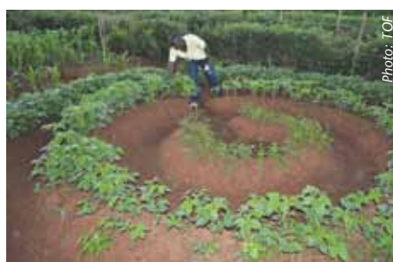
Mandala kitchen garden.

working to improve soil fertility and water conservation by practicing many crop management technologies. These include multi-cropping, companion planting, agro-forestry, ecological pest management, animal husbandry, and kitchen gardening technologies.