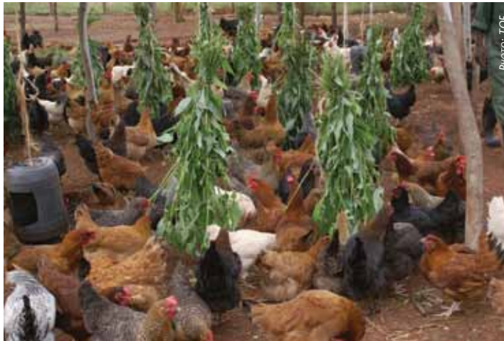
Organic chickens in Mbeere Sub-County, Kenya: Organic chickens require adequate space or run where they can feed and move freely.

A key benefit of consuming organic free range eggs is that you avoid or minimize your exposure to antibiotics and synthetic hormones which may be harmful to your endocrine and hormonal system. Toxic pesticides, like glyphosate, an organophosphate, found in most grain feeds has been classified by the World Health Organisation (WHO) as a type 2A carcinogen (cancer causing).