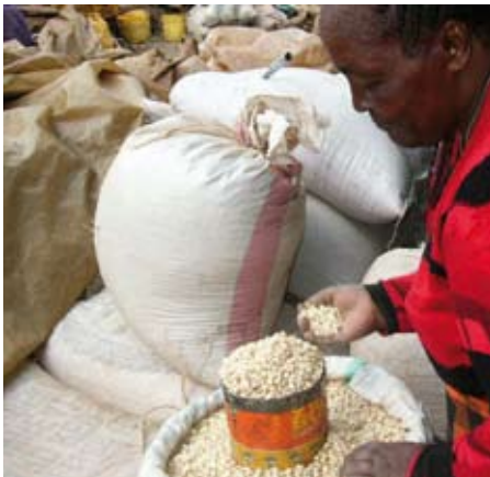
Food prices have gone up locally, (TOF)

Areas hit by the clashes are mainly the high potential food producing regions where most of the agricultural commodities are produced. This