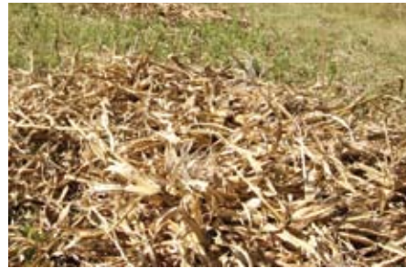
... do not burn plant residue. vation agriculture is to ensure that the farmer gets a high crop yield while at the same time maintaining soil fertility and also conserving water.

In conventional farming, farmers plough or use hoes to improve the soil structure and control weeds. By ploughing, they actually destroy the soil structure and contribute to soil infertility. In conservation agriculture, ripping the soil to make planting lines is practiced. Ripping helps break the hard pan which forms on the top soil when the soil is compacted. Alternatively, holes are dug into the soils and the seeds planted. The idea is to plant directly into the soil without ploughing it.