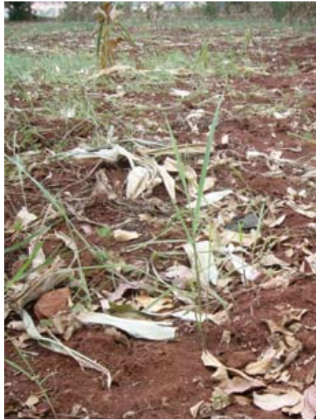
Do not disturb the soil too much...

Conservation agriculture (or minimum tillage) has three basic principles: Maintaining the soil structure through minimum tillage (land preparation), keeping the soil covered as much as possible and practising crop rotation. The main aim of encouraging conser-