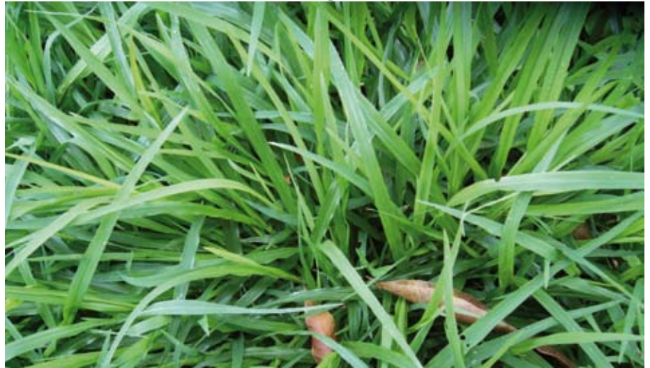
Kikuyu grass (Whittet), this is an improved variety popular with many farmers. (TOF)

Research shows that dry matter and crude protein content in kikuyu grass is higher than that of Boma Rhodes