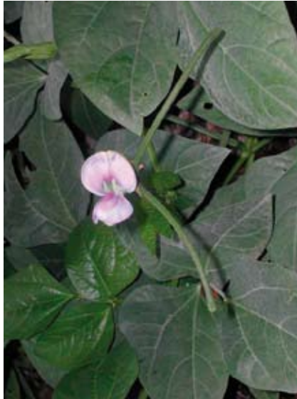
A flowering cowpeas plant

Cowpeas are a well-adapted and reliable fodder crop in Southern Africa as well as in Kenya. They do well in areas with a marginal rainfall (200-400mm) because they can tolerate a dry climate and are suitable for a variety of inter-cropping systems since they are nitrogen fixing, thus improving soil quality.