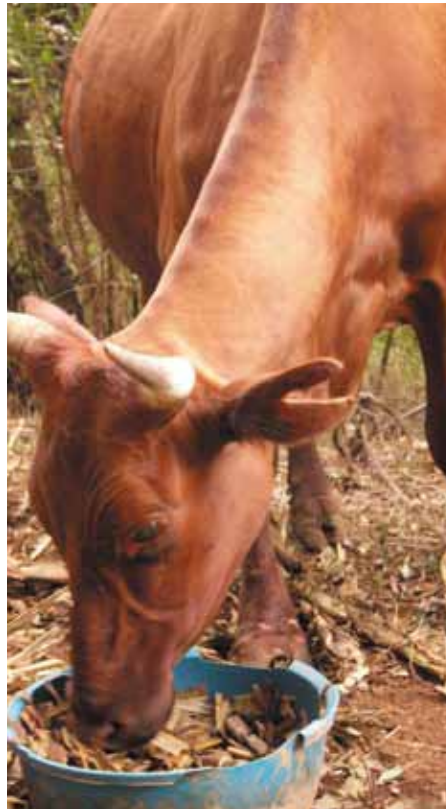
Use quality fodder to feed your cow.

All grasses are good sources of energy, but only if they are fed at a young stage. The most popular fodder grasses include Napier grass, Kikuyu grass, Rhodes grasses, Nandi setaria, Guate-