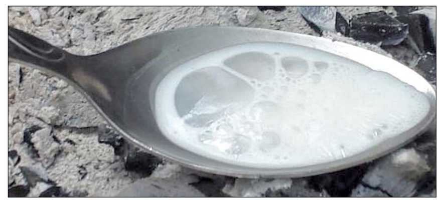
Clot on boiling test; if it clots the milks has gone bad