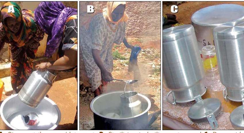
A: Rinse out the soap/detergent; B: Sterilising in boiling water; and C: Dry upside down in the sun on a clean table or rack

5. Dry upside down in the sun on a clean table or rack. The sun is a very good steriliser as well, but care should be taken that recontamination from blowing dust does occur.