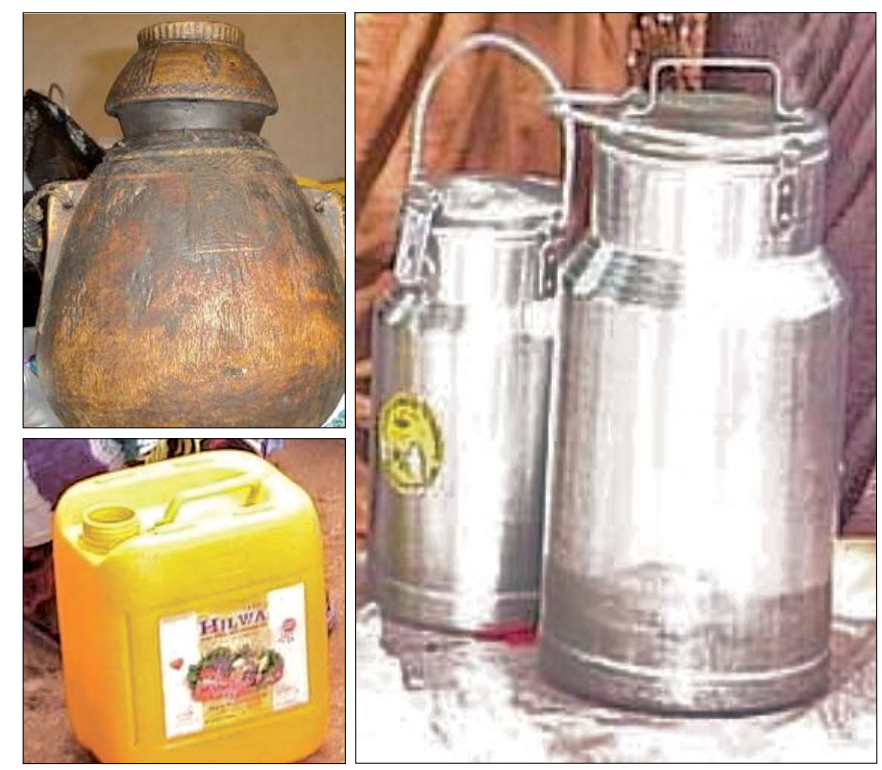
Aluminum and stainless steel milk cans are much easier to clean than both the traditional containers and the jerricans. They can be disinfected after washing by dipping in boiling water, and become virtually germ free – which means longer shelf life for the milk as there is no contamination from cans

In high potential areas heavier duty milk cans are used as they need to be able to withstand punishment in a different type of transport – pure milk transporting vehicles.