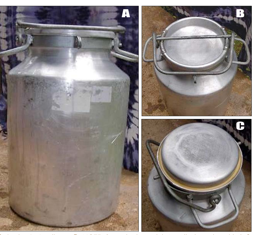
A: Perdini 25 L milk can; B: NOTE: Securely closing lid. A padlock can be added; C: NOTE: inside rubber seal in lid to make sure it does not spill