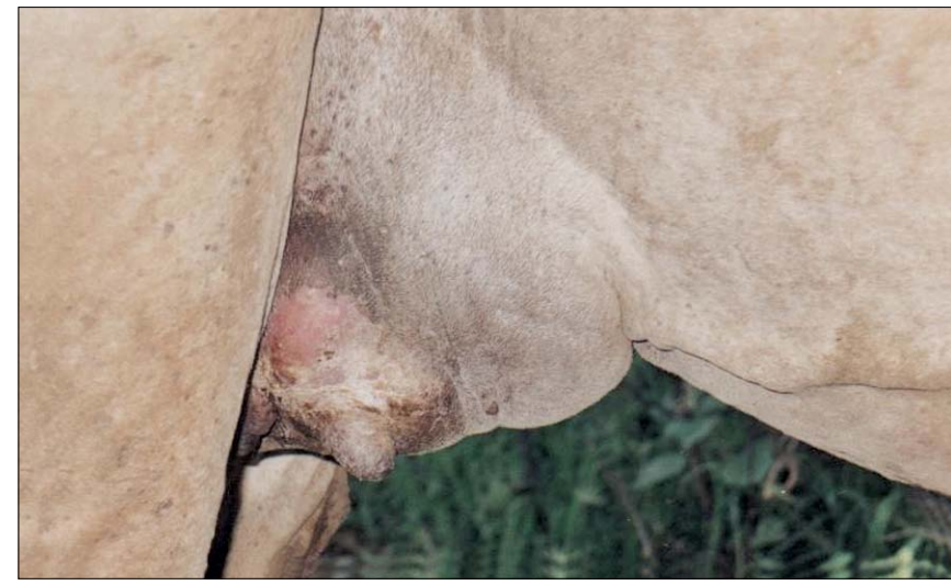
Mastitis symptoms in high yielding camel (note large milk vein). The quarter has become hard and hot to the touch, and a red swelling has appeared. The camel may kick excessively as the quarter has become painful to the touch.

Mastitis is the name for the inflammation of one or more milk canals and the udder of milk producing mammals.