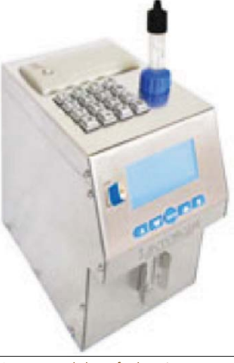
Many models of the Lactoscan available (please check the internet)

CAMEL MILK: A Practical Guide to Hygienic Prod