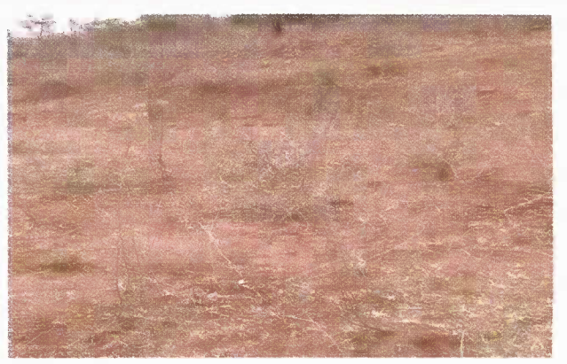
Plate 4: Low survival of trees due to poor soils and low soil moisture

Prepare the land before the rains (during the dry season) to enable early planting. Land preparation, which mainly involves land clearing and pitting, improves tree survival in the drylands when properly done.