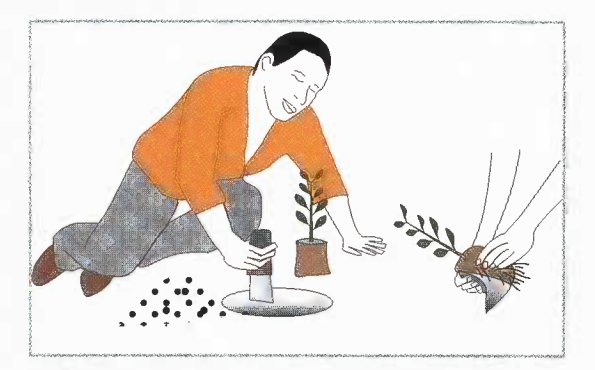
Figure 3: Planting a tree seedling

The best time to plant tree seedlings is immediately the rainy season begins. The earlier the planting the better the tree survival, as this exposes the planted trees to the maximum rainy days possible before the dry season starts. There should be enough moisture on the ground before you plant. Make a hole the size of the seedling container in the middle of the planting pit using a jembe or a machete (Figure 3).