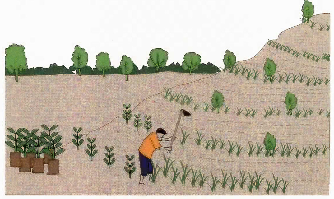
Figure 2: Intercropping of trees and crops