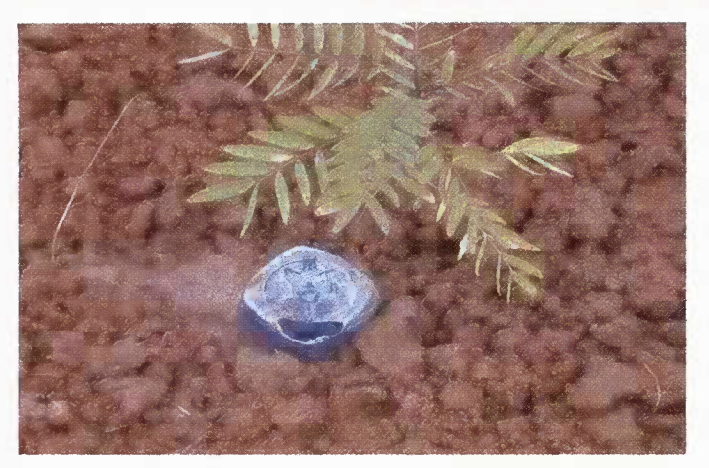
Plate 6: Bottle watering of Senna siamea

making a tiny hole in the bottom corner of a 3-5 litre plastic bottle and inserting it full length near the tree seedling (Plate 6). The technique reduces water loss through evapo- transpiration and reduces the frequency of watering. A 3-litre bottle can last for a week.