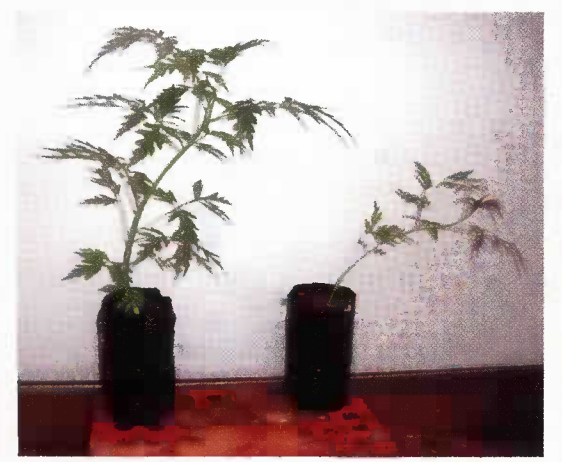
Plate 2: Hardened seedling of M. volkensii (left) has greyish stout stems. Unhardened seedling (right) is green and weak.

Hardening up is needed to prepare the seedlings to withstand the shock caused by possible harsh field conditions. Seedlings are hardened up in several ways such as through gradual removal of shade, increased frequency of root pruning, and reduced watering. If seedlings are from an external source, ensure that they have been hardened up. Characteristics of properly hardened up seedlings are stout stems and fewer but stronger leaves (Plate 2).