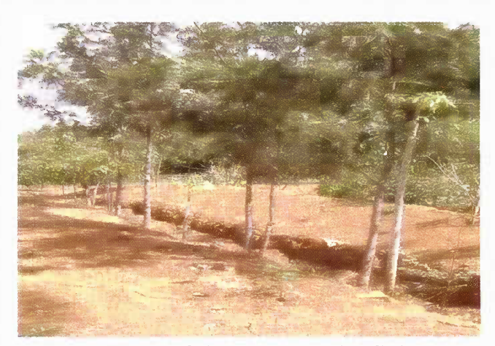
Plate 5: Trees planted along water retention ditches

• Water retention ditches: These are structures dug to divert and retain water that would otherwise be lost as run-off, and directed to the farms. Trees planted along these structures survive better (Plate 5).