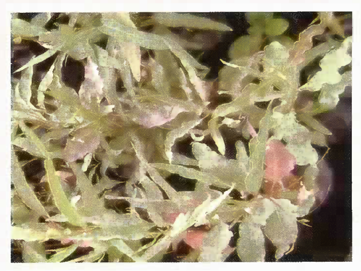
Plate 1: Diseased seedlings of Eucalyptus camaldulensis

You can also spray insecticides/ fungicides on the seedlings before planting.