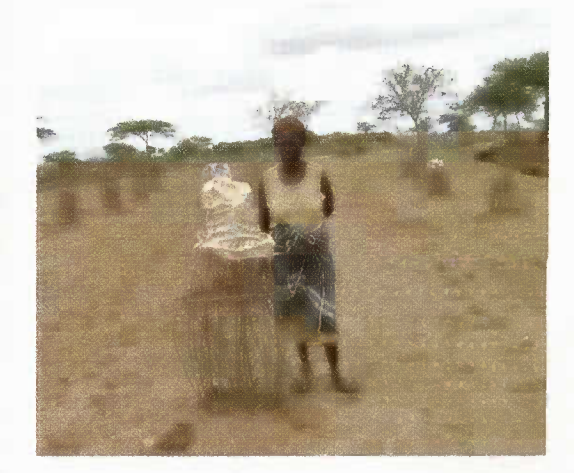
Plate 7: Individual tree protection

If you have many trees it may be cost effective to fence the entire plot. You can use chain link or barbed wire. Chain link fencing is expensive but very effective for control of all types of animals while barbed wire fence is moderately expensive but may not be able to control small animals such as young goats and dik diks. A barbed wire fence when reinforced with thorny branches can be quite effective for both large and small animals. You can further reduce the cost of fencing by relocating the fence to a second location after the trees are big enough.