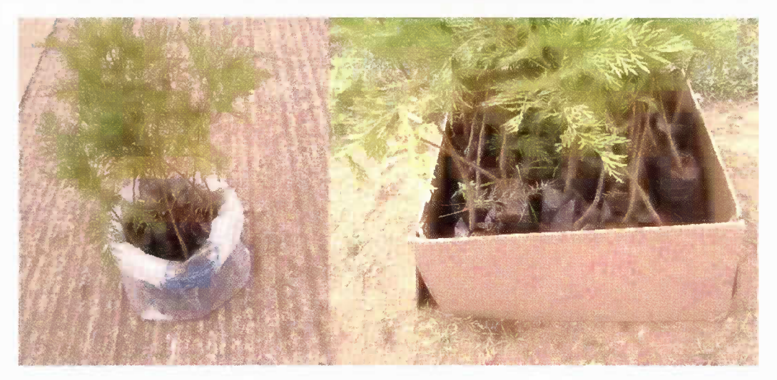
Plate 3: Well packed seedlings ready for transportation