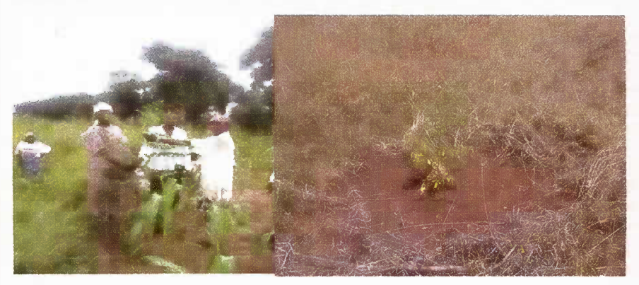
Plate 9: Completely weeded Melia volkensii trees (left) and spot weeded Melia of the same age (right)