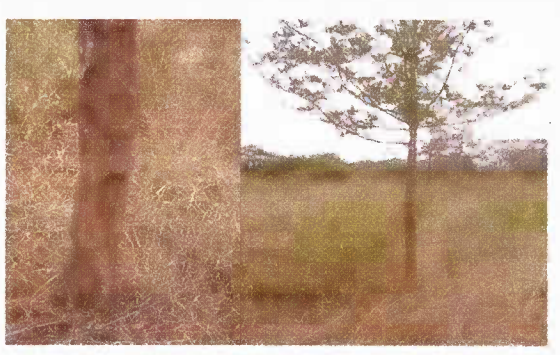
Plate 8: Grevillea robusta infested with termites

• Planting tree species that are less prone to termite attack such as Melia volkensii and Senna siamea . Species prone to termite infestation such as Grevillea robusta are not recomended for planting in heavily infested sites (Plate 8).