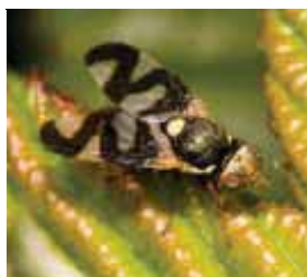
An adult gall fly