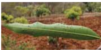
Mango leaf affected by gall flies

orchard. In Machakos the gall flies have been a problem to farmers who are finding it difficult to control. The flies lay eggs on young leaves which hatch into maggots that dig into the leaves to feed resulting in formation of small 'pimples' or galls on the leaves. The affected