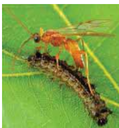
A wasp attacking a fruit fly caterpillar

orchard. In Machakos the gall flies have been a problem to farmers who are finding it difficult to control. The flies lay eggs on young leaves which hatch into maggots that dig into the leaves to feed resulting in formation of small 'pimples' or galls on the leaves. The affected