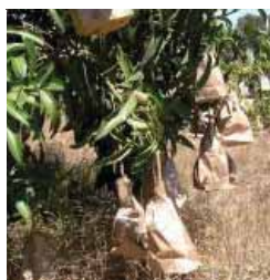
Paper bags preventing fruit fly invasion