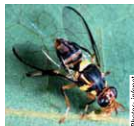
An adult fruit fly