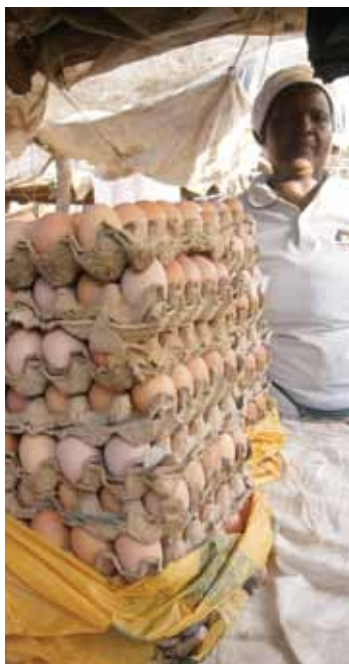
Eggs on sale in a market