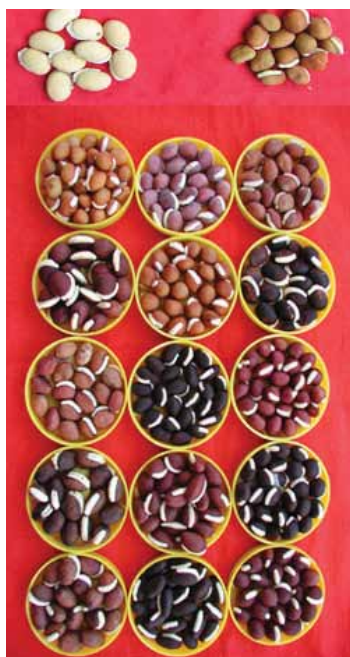
Varieties of dolichos