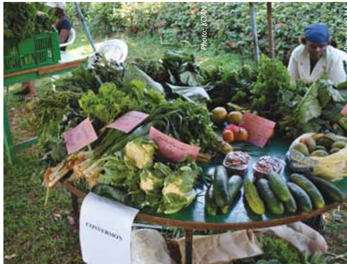
A farmer sells her organic produce during an organic farmers market day in Nairobi.

PGS shares a common goal with third-party certification systems in providing a credible guarantee for consumers seeking organic produce. The difference is in the approach. In PGS, farmers and consumers are encouraged and required to