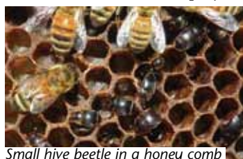
Small hive beetle in a honey comb