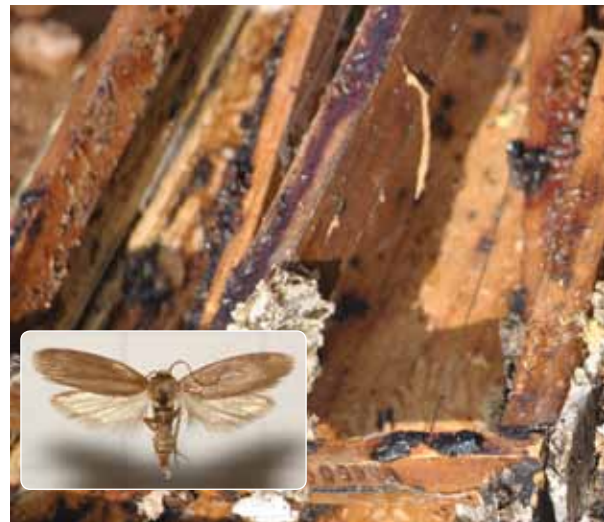
Beekeepers should always check their hives for the presence of mites, and burning the honey combs and cleaning the hives.

The source of the mites in East Africa is not yet known.