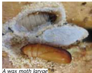
A wax moth larva

Although not common in hives in East Africa, the wax moth can be destructive in infested hives. The moth lays eggs and their grubs (larvae), eat the comb, wax and honey. These moths liter-